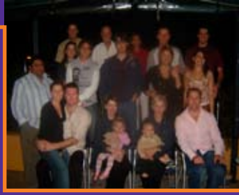
distributor weekend 2005