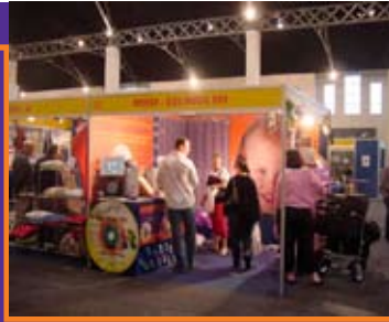
kidz expo 2004