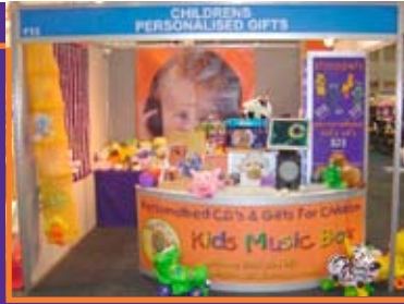
melbourne parents and babies expo