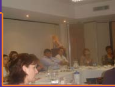
kmb weekend 2005 discussions and speakers