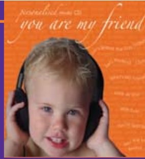
you are my friend cover

"Christmas Is Coming" 4 minute song using the childs name 11 times.