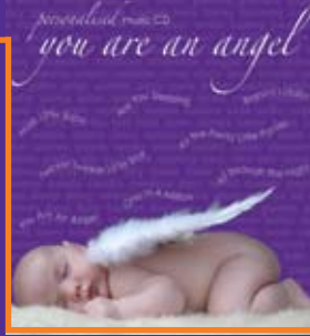
you are an angel cover